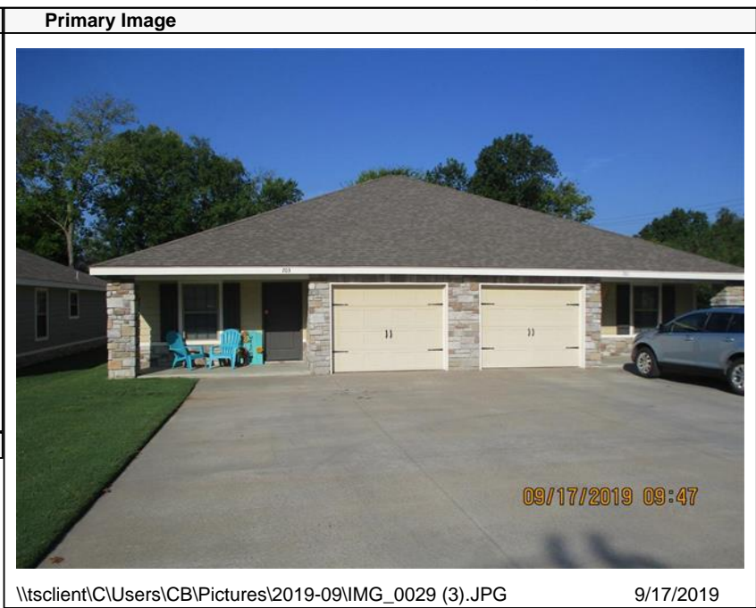
\\tsclient\C\Users\CB\Pictures\2019-09\IMG_0029 (3).JPG 9/17/2019