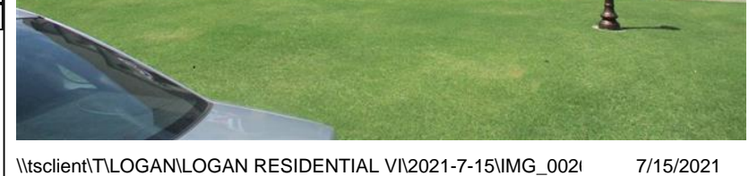
\\tsclient\T\LOGAN\LOGAN RESIDENTIAL VI\2021-7-15\IMG_002I 7/15/2021