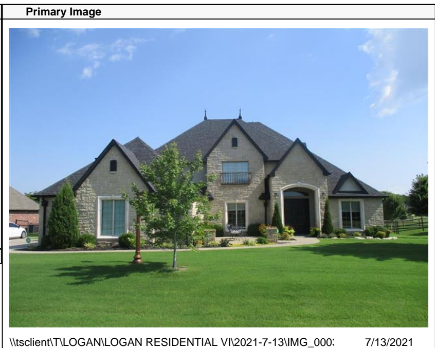
\\tsclient\T\LOGAN\LOGAN RESIDENTIAL VI\2021-7-13\IMG_000: 7/13/2021