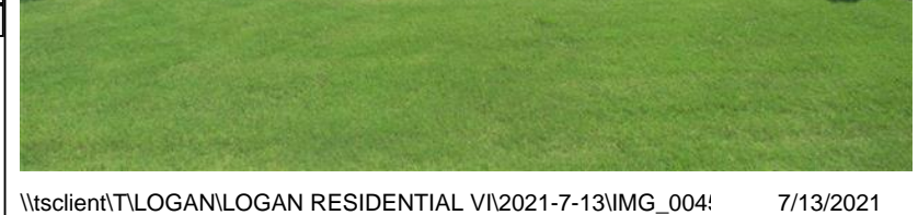
\\tsclient\T\LOGAN\LOGAN RESIDENTIAL VI\2021-7-13\IMG_004! 7/13/2021