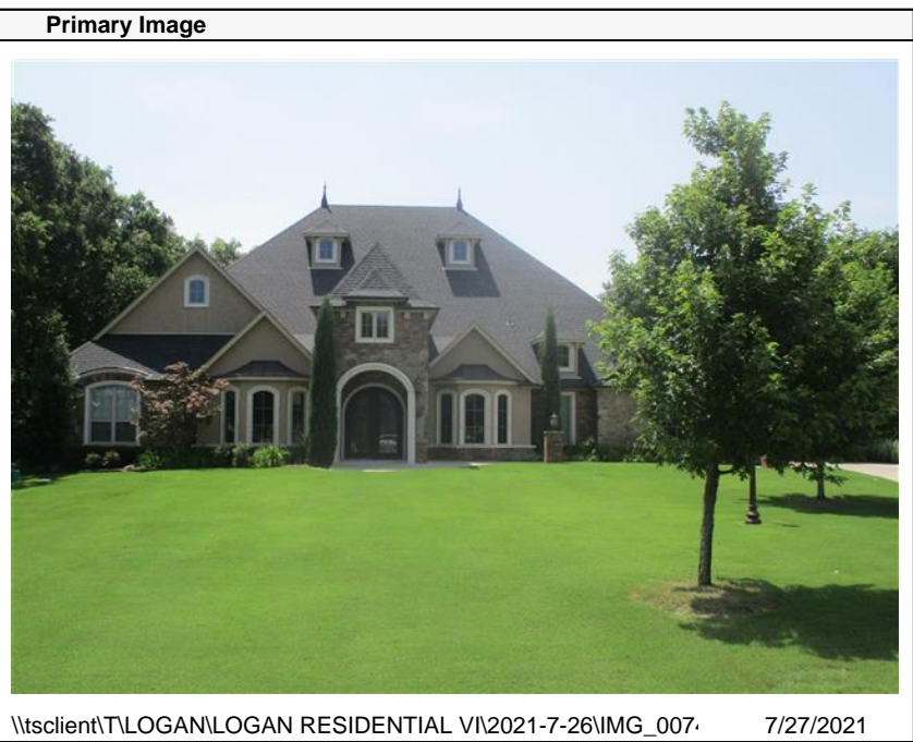
\\tsclient\T\LOGAN\LOGAN RESIDENTIAL VI\2021-7-26\IMG_007 7/27/2021