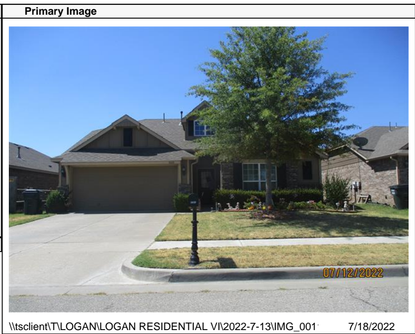
\\tsclient\T\LOGAN\LOGAN RESIDENTIAL VI\2022-7-13\IMG_001 7/18/2022