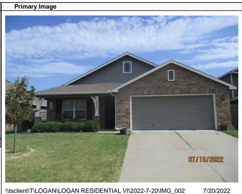
\\tsclient\T\LOGAN\LOGAN RESIDENTIAL VI\2022-7-20\IMG_002 7/20/2022