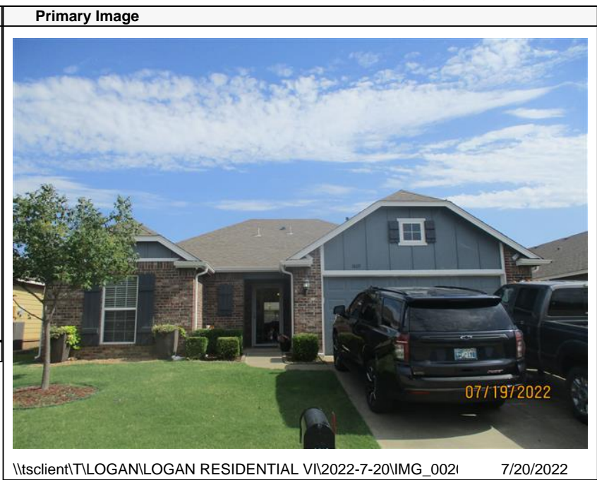
\\tsclient\T\LOGAN\LOGAN RESIDENTIAL VI\2022-7-20\IMG_002I 7/20/2022