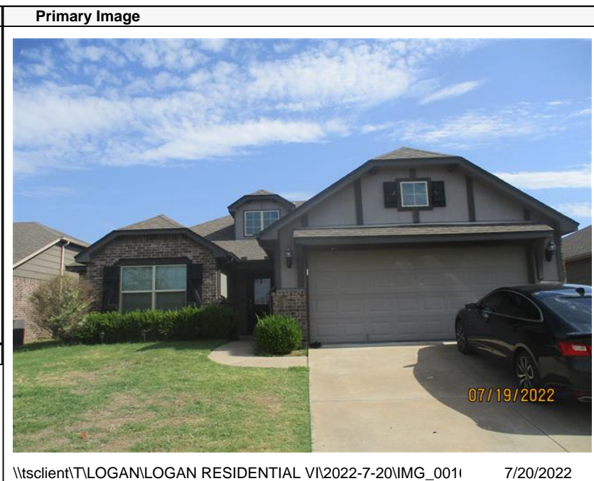
\\tsclient\T\LOGAN\LOGAN RESIDENTIAL VI\2022-7-20\IMG_001 7/20/2022