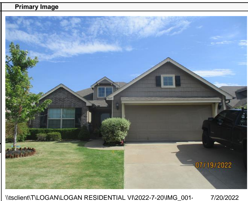
\\tsclient\T\LOGAN\LOGAN RESIDENTIAL VI\2022-7-20\IMG_001 7/20/2022