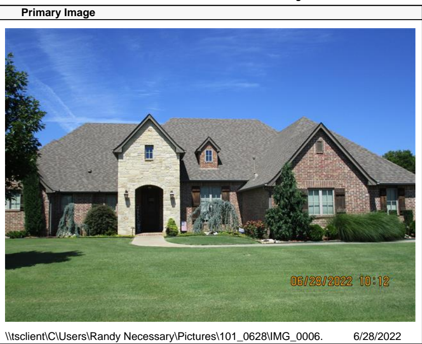
\\tsclient\C\Users\Randy Necessary\Pictures\101_0628\IMG_0006. 6/28/2022