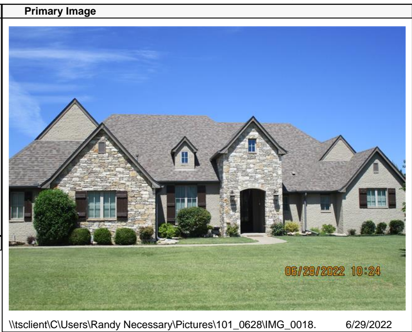
\\tsclient\C\Users\Randy Necessary\Pictures\101_0628\IMG_0018. 6/29/2022