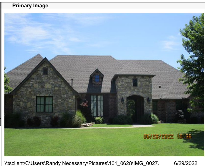
\\tsclient\C\Users\Randy Necessary\Pictures\101_0628\IMG_0027. 6/29/2022