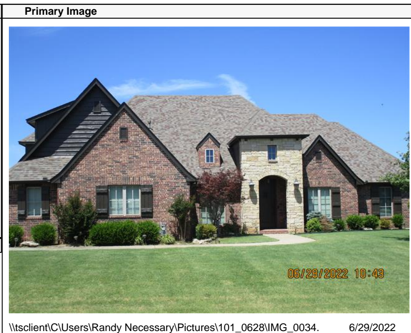
\\tsclient\C\Users\Randy Necessary\Pictures\101_0628\IMG_0034. 6/29/2022