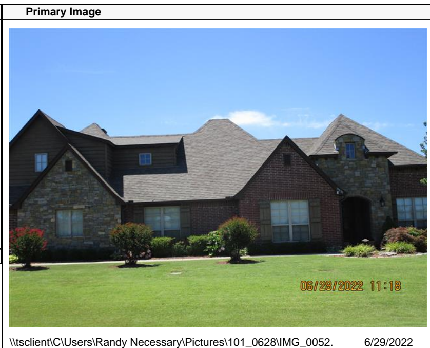
\\tsclient\C\Users\Randy Necessary\Pictures\101_0628\IMG_0052. 6/29/2022