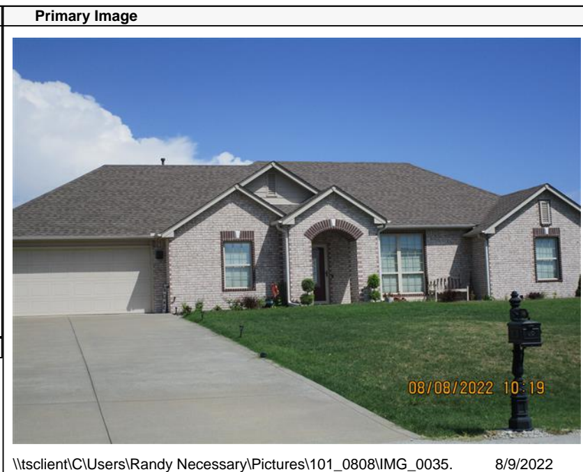
\\tsclient\C\Users\Randy Necessary\Pictures\101_0808\IMG_0035. 8/9/2022