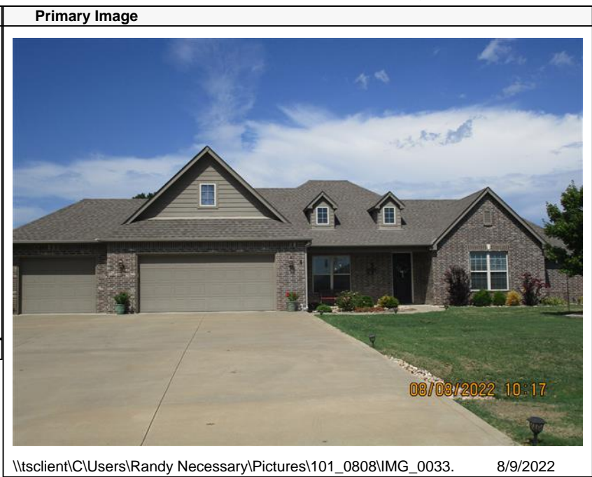
\\tsclient\C\Users\Randy Necessary\Pictures\101_0808\IMG_0033. 8/9/2022