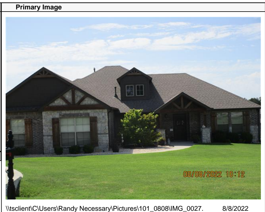
\\tsclient\C\Users\Randy Necessary\Pictures\101_0808\IMG_0027. 8/8/2022