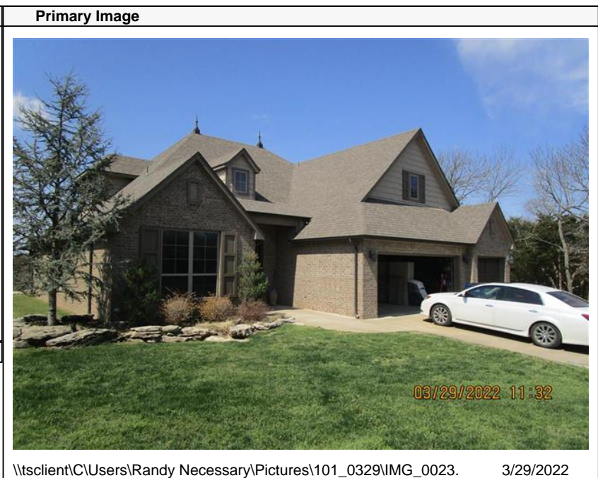
\\tsclient\C\Users\Randy Necessary\Pictures\101_0329\IMG_0023. 3/29/2022