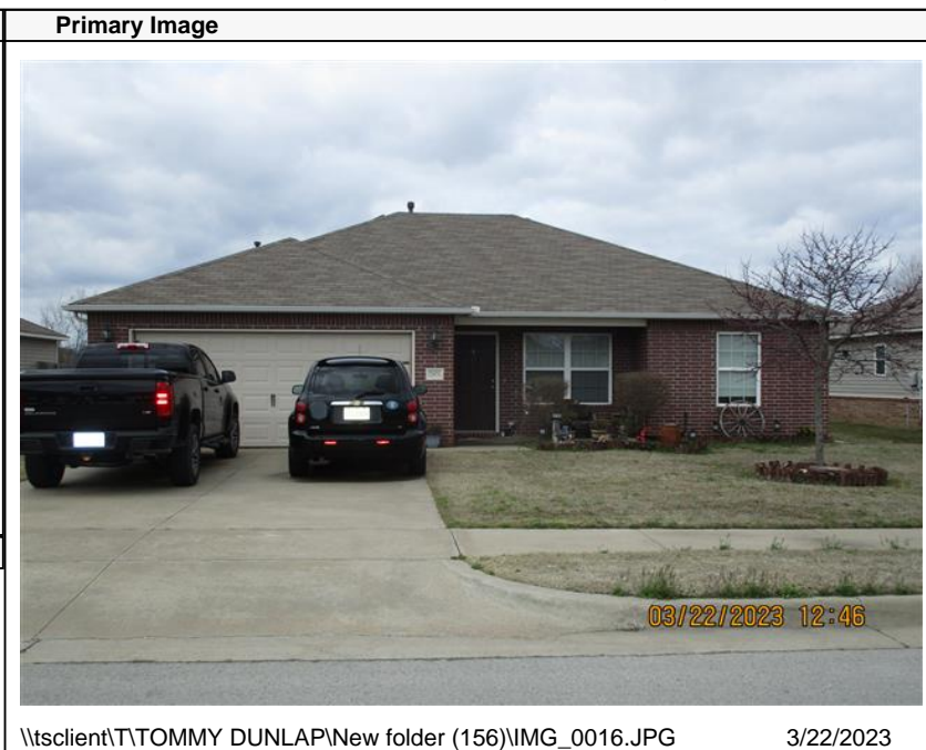
\\tsclient\T\TOMMY DUNLAP\New folder (156)\IMG_0016.JPG 3/22/2023