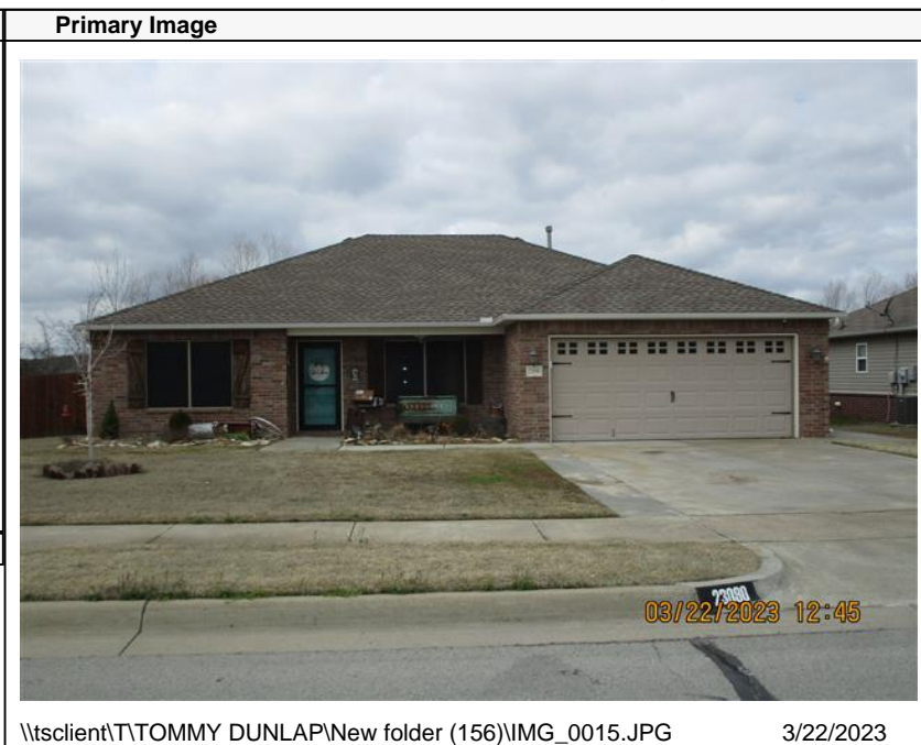
\\tsclient\T\TOMMY DUNLAP\New folder (156)\IMG_0015.JPG 3/22/2023