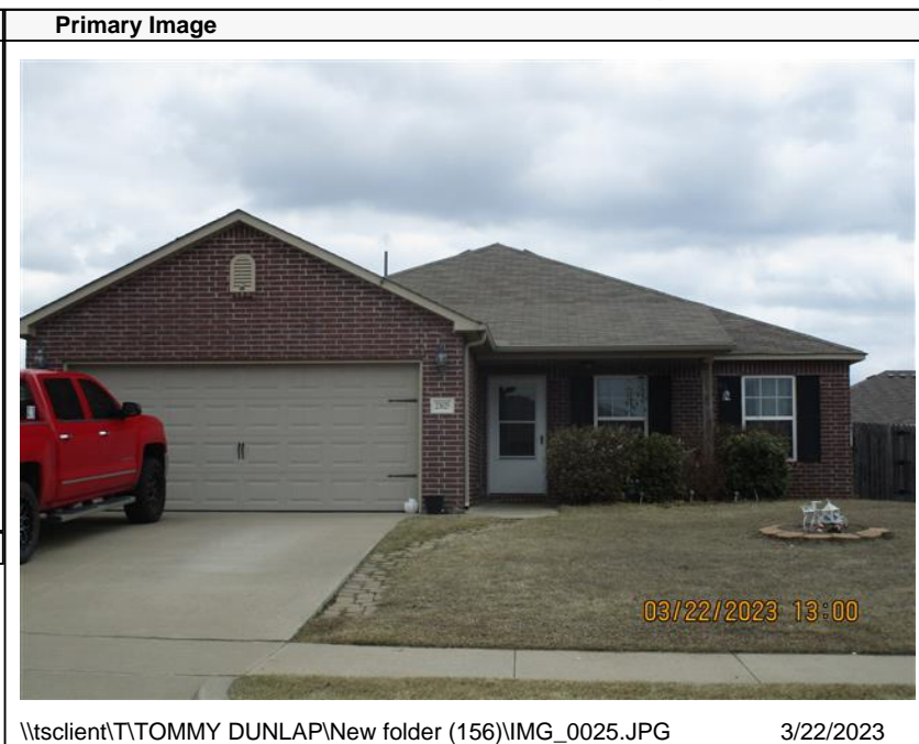
\\tsclient\T\TOMMY DUNLAP\New folder (156)\IMG_0025.JPG 3/22/2023