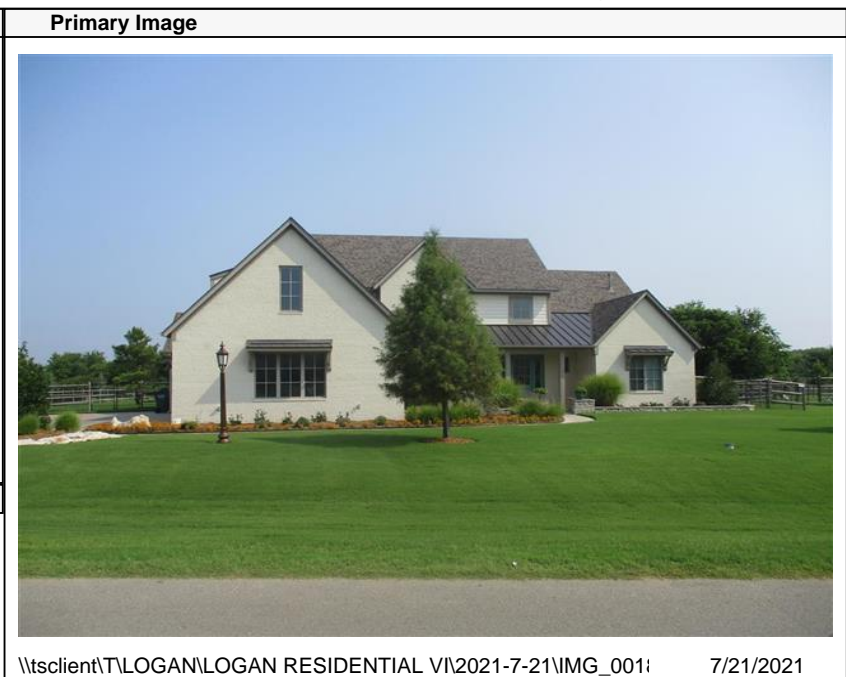
\\tsclient\T\LOGAN\LOGAN RESIDENTIAL VI\2021-7-21\IMG_001; 7/21/2021