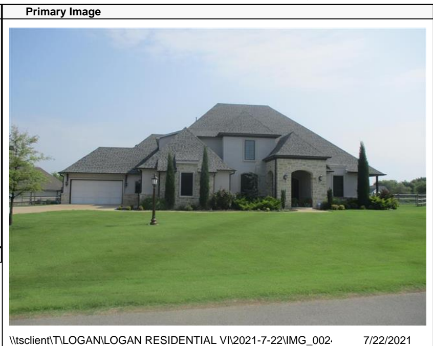
\\tsclient\T\LOGAN\LOGAN RESIDENTIAL VI\2021-7-22\IMG_002 7/22/2021