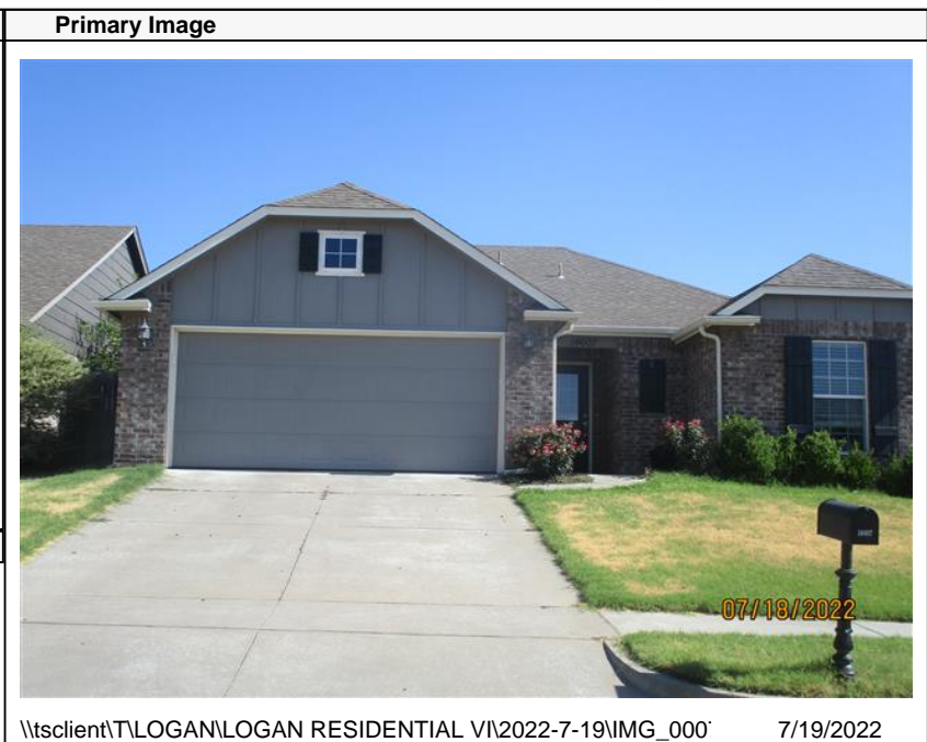
\\tsclient\T\LOGAN\LOGAN RESIDENTIAL VI\2022-7-19\IMG_000' 7/19/2022