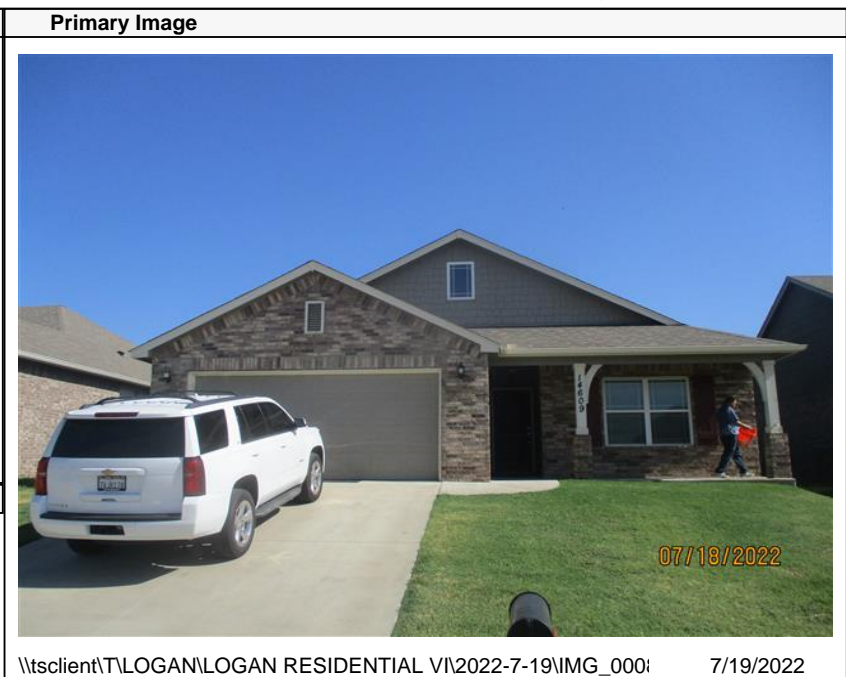
\\tsclient\T\LOGAN\LOGAN RESIDENTIAL VI\2022-7-19\IMG_0001 7/19/2022