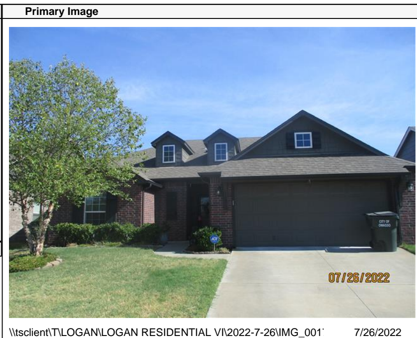
\\tsclient\T\LOGAN\LOGAN RESIDENTIAL VI\2022-7-26\IMG_001' 7/26/2022