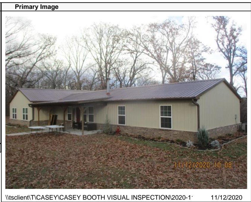
\\tsclient\TCASEY\CASEY BOOTH VISUAL INSPECTION\2020-1' 11/12/2020