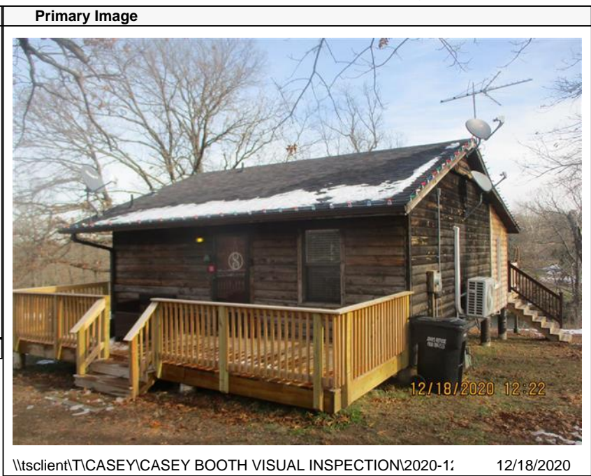
\\tsclient\TCASEY\CASEY BOOTH VISUAL INSPECTION\2020-1; 12/18/2020