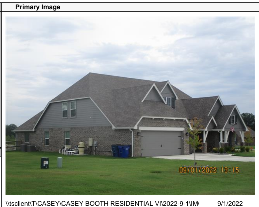
\\tsclient\TCASEY\CASEY BOOTH RESIDENTIAL VI\2022-9-1\IM 9/1/2022