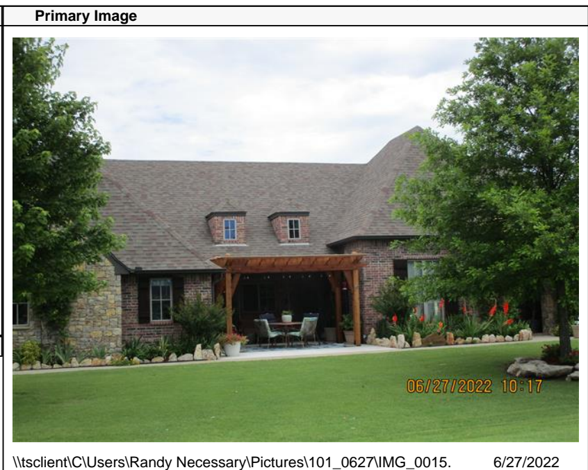
\\tsclient\C\Users\Randy Necessary\Pictures\101_0627\IMG_0015. 6/27/2022