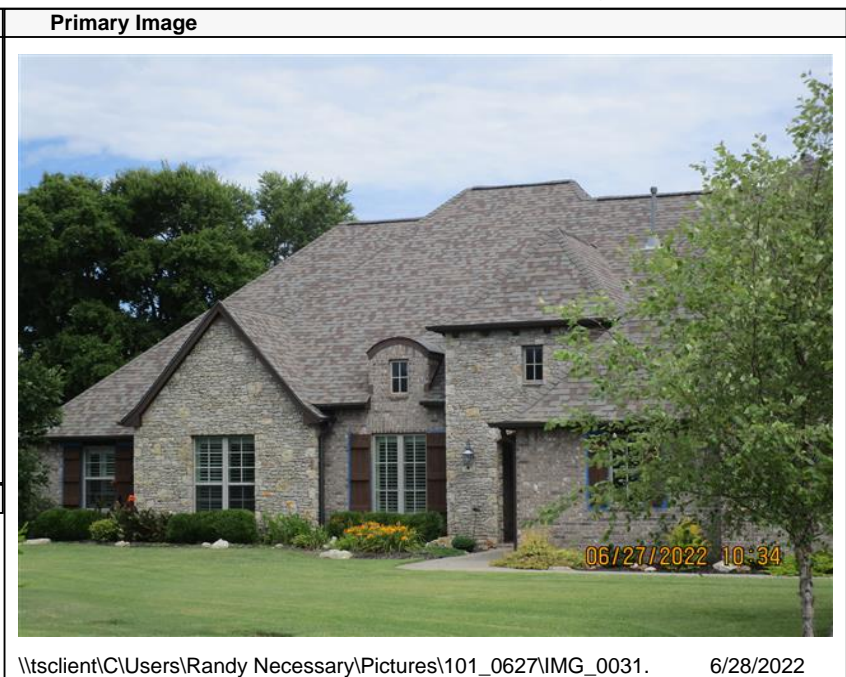
\\tsclient\C\Users\Randy Necessary\Pictures\101_0627\IMG_0031. 6/28/2022