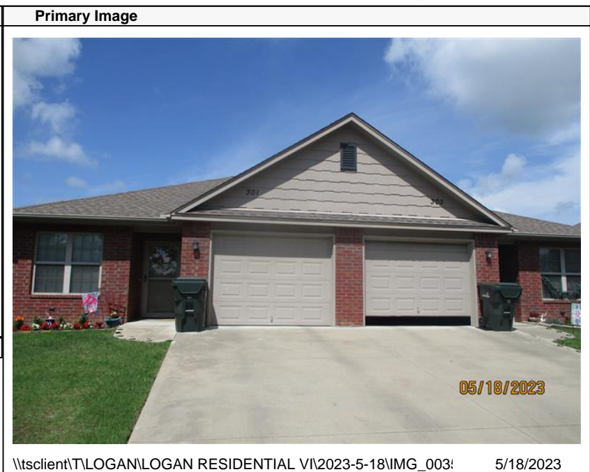
\\tsclient\T\LOGAN\LOGAN RESIDENTIAL VI\2023-5-18\IMG_003! 5/18/2023