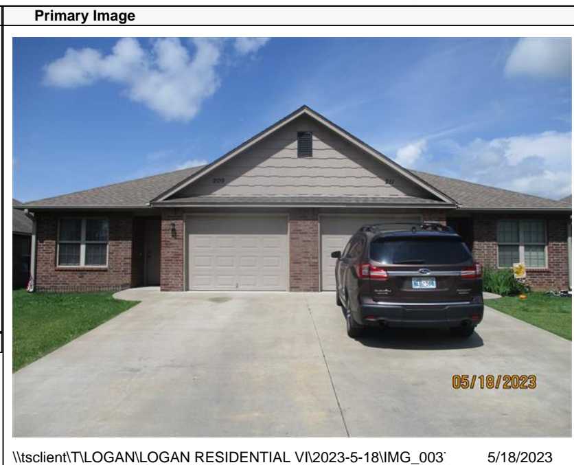
\\tsclient\T\LOGAN\LOGAN RESIDENTIAL VI\2023-5-18\IMG_003' 5/18/2023