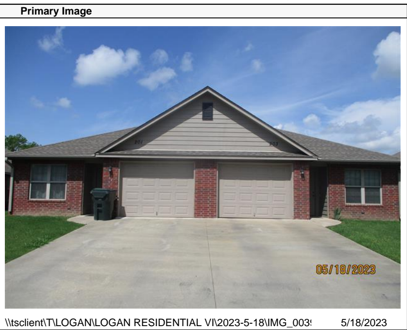
\\tsclient\T\LOGAN\LOGAN RESIDENTIAL VI\2023-5-18\IMG_003! 5/18/2023