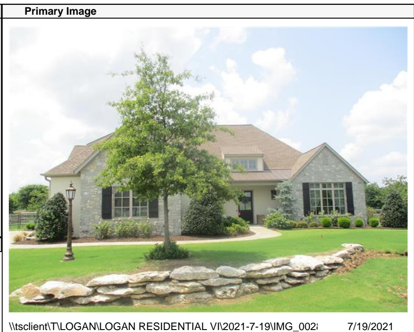
\\tsclient\T\LOGAN\LOGAN RESIDENTIAL VI\2021-7-19\IMG_002 7/19/2021