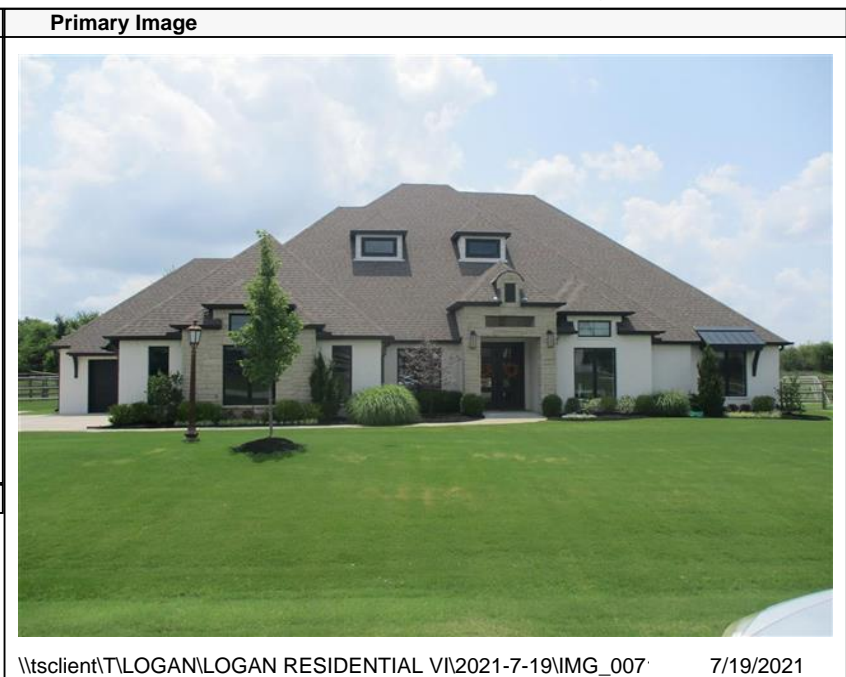
\\tsclient\T\LOGAN\LOGAN RESIDENTIAL VI\2021-7-19\IMG_007 7/19/2021