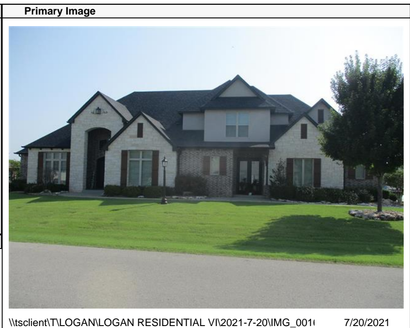
\\tsclient\T\LOGAN\LOGAN RESIDENTIAL VI\2021-7-20\IMG_001 7/20/2021