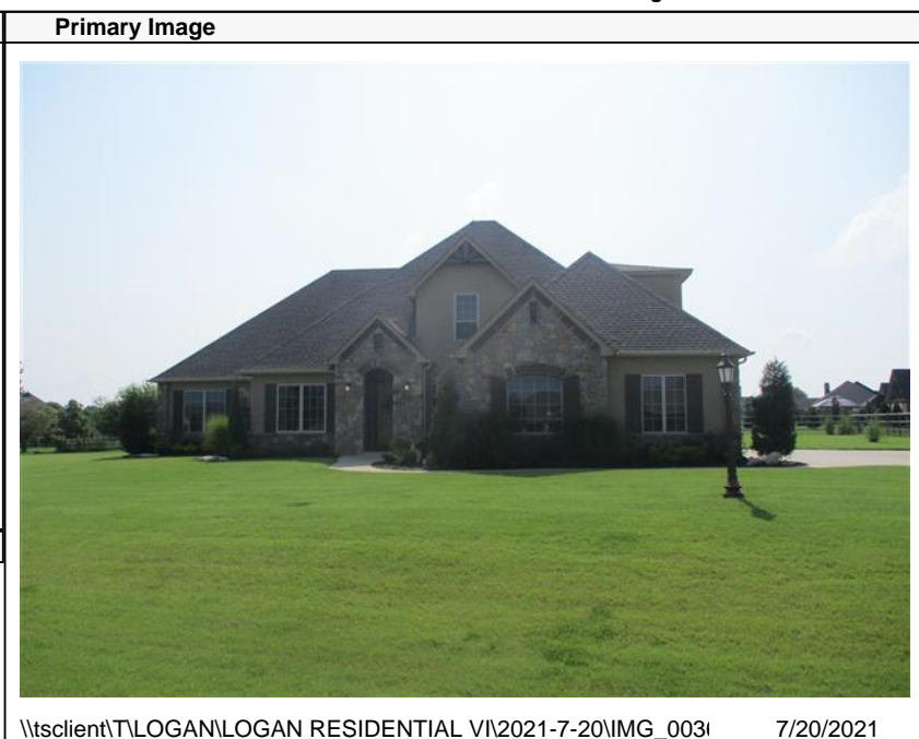
\\tsclient\T\LOGAN\LOGAN RESIDENTIAL VI\2021-7-20\IMG_003I 7/20/2021