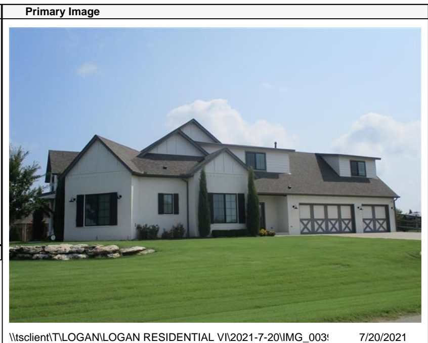
\\tsclient\T\LOGAN\LOGAN RESIDENTIAL VI\2021-7-20\IMG_003! 7/20/2021