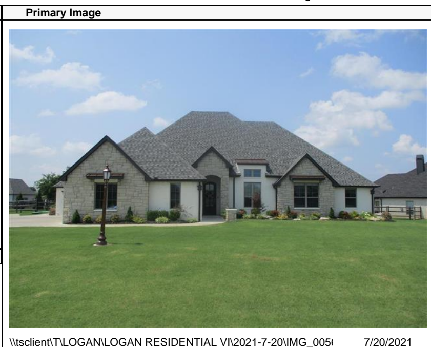
\\tsclient\T\LOGAN\LOGAN RESIDENTIAL VI\2021-7-20\IMG_005I 7/20/2021