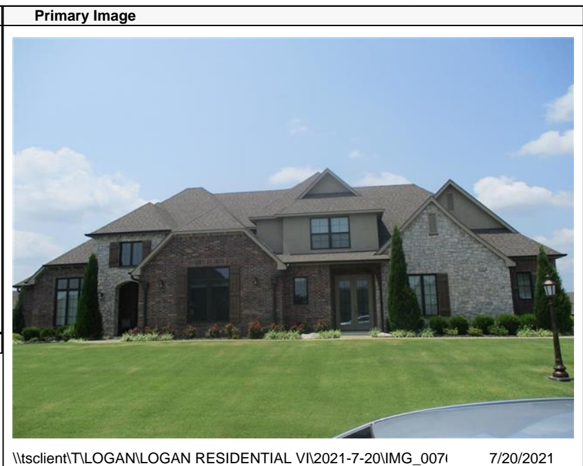
\\tsclient\T\LOGAN\LOGAN RESIDENTIAL VI\2021-7-20\IMG_0071 7/20/2021