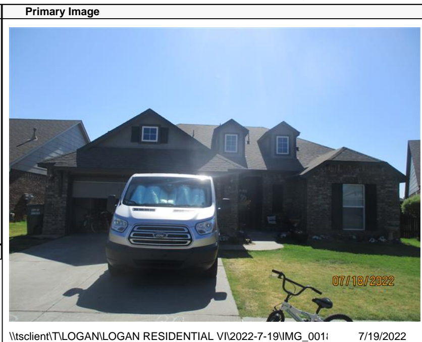
\\tsclient\T\LOGAN\LOGAN RESIDENTIAL VI\2022-7-19\IMG_001 7/19/2022