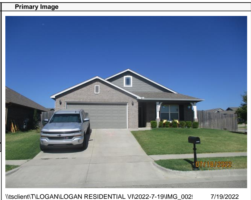
\\tsclient\T\LOGAN\LOGAN RESIDENTIAL VI\2022-7-19\IMG_002! 7/19/2022