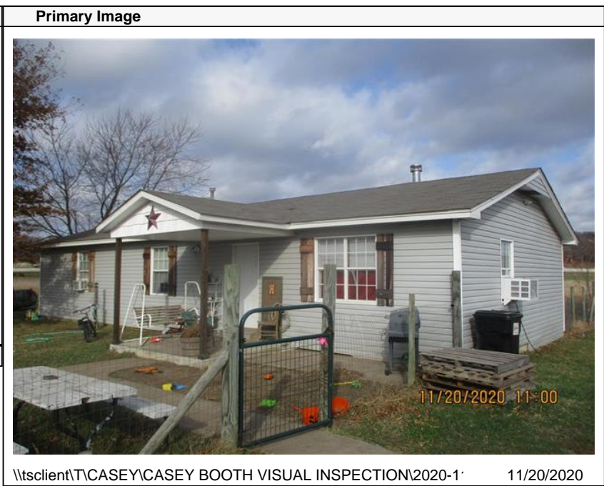
\\tsclient\TCASEY\CASEY BOOTH VISUAL INSPECTION\2020-1' 11/20/2020