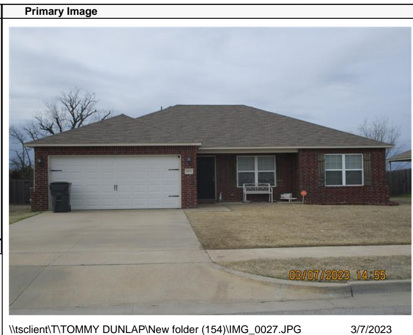
\\tsclient\T\TOMMY DUNLAP\New folder (154)\IMG_0027.JPG 3/7/2023