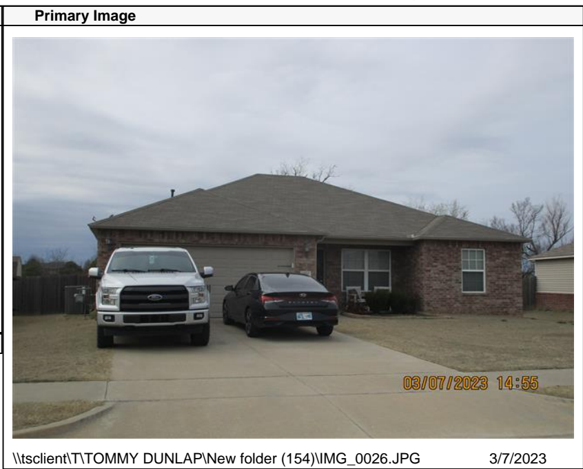
\\tsclient\T\TOMMY DUNLAP\New folder (154)\IMG_0026.JPG 3/7/2023