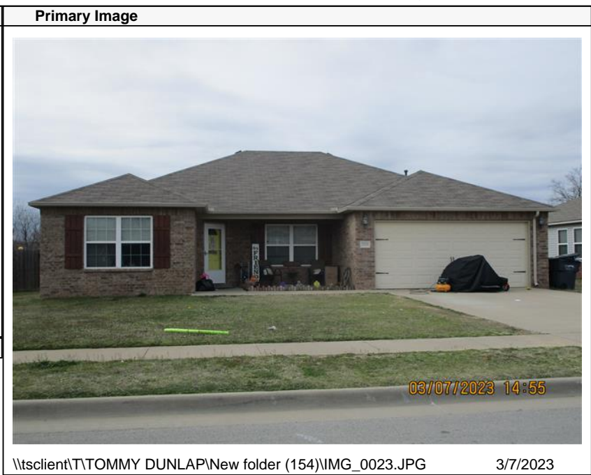
\\tsclient\T\TOMMY DUNLAP\New folder (154)\IMG_0023.JPG 3/7/2023