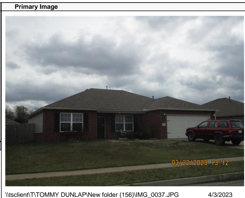
\\tsclient\T\TOMMY DUNLAP\New folder (156)\IMG_0037.JPG 4/3/2023