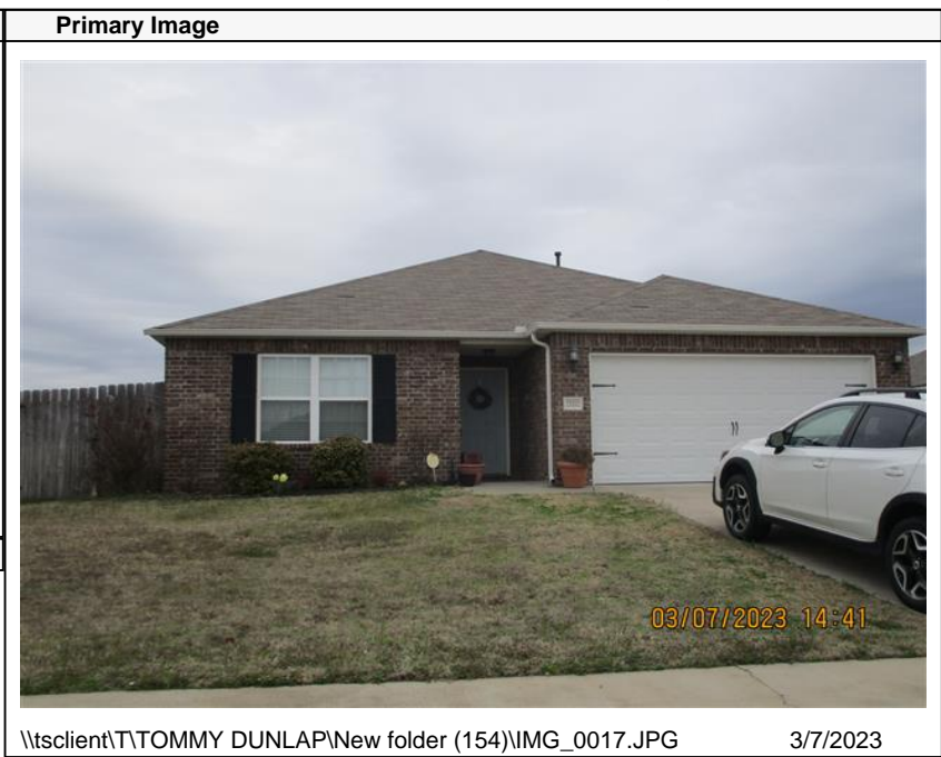
\\tsclient\T\TOMMY DUNLAP\New folder (154)\IMG_0017.JPG 3/7/2023